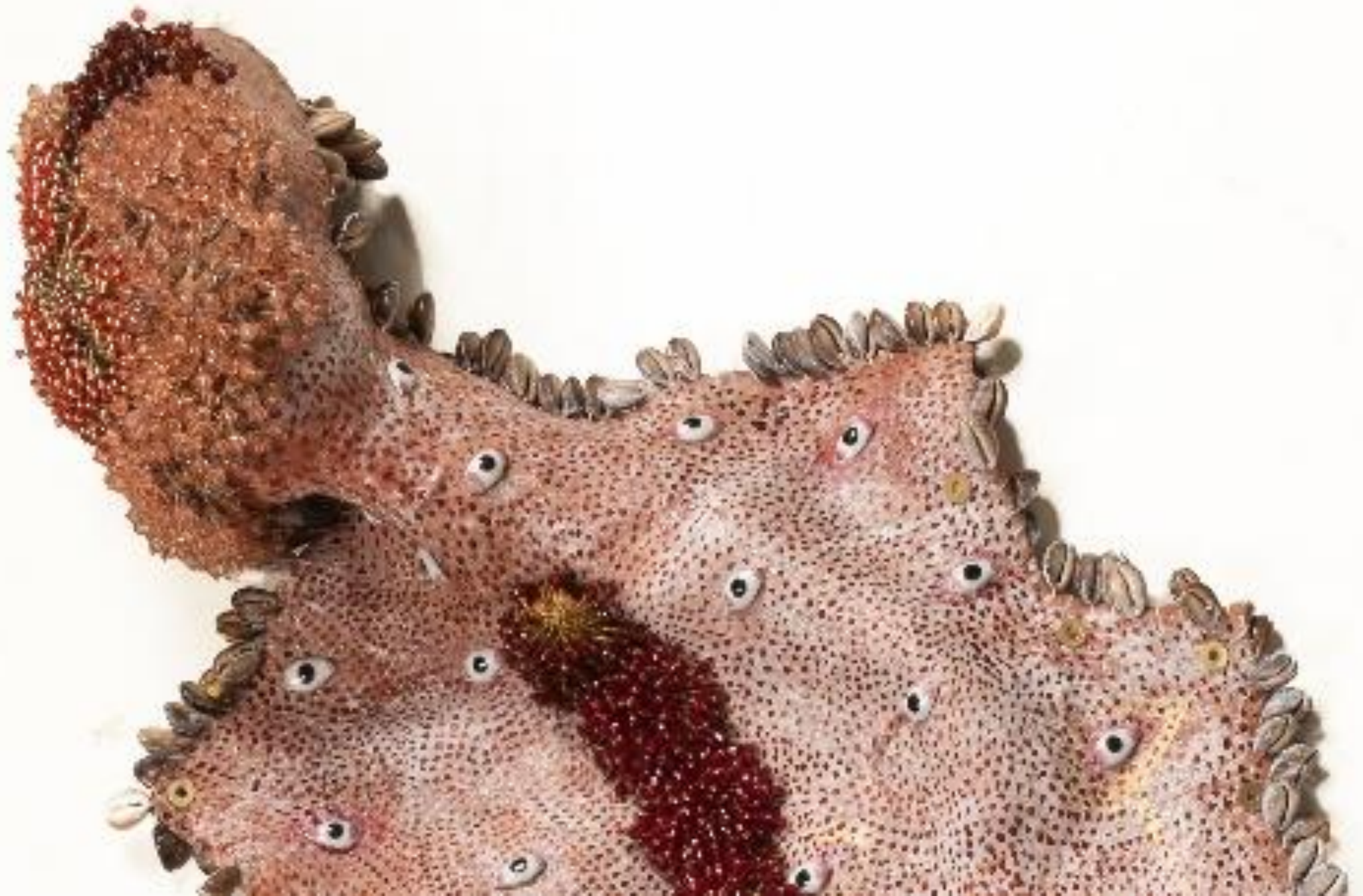
Detail of Shells of Past Life 2