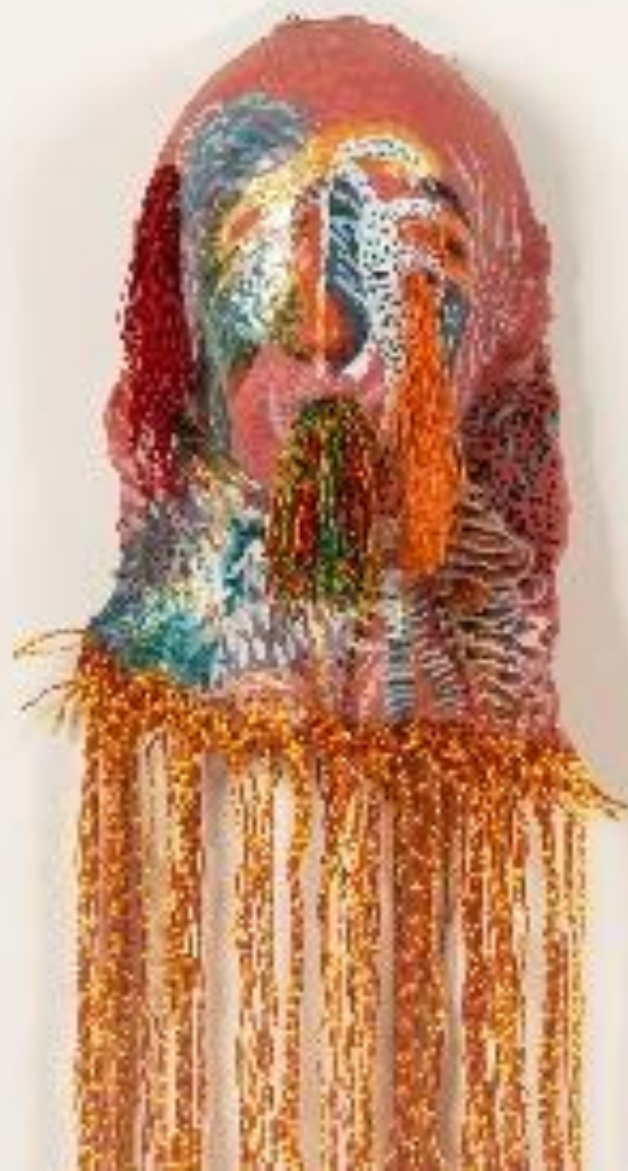
Detail of Veils of Rebirth