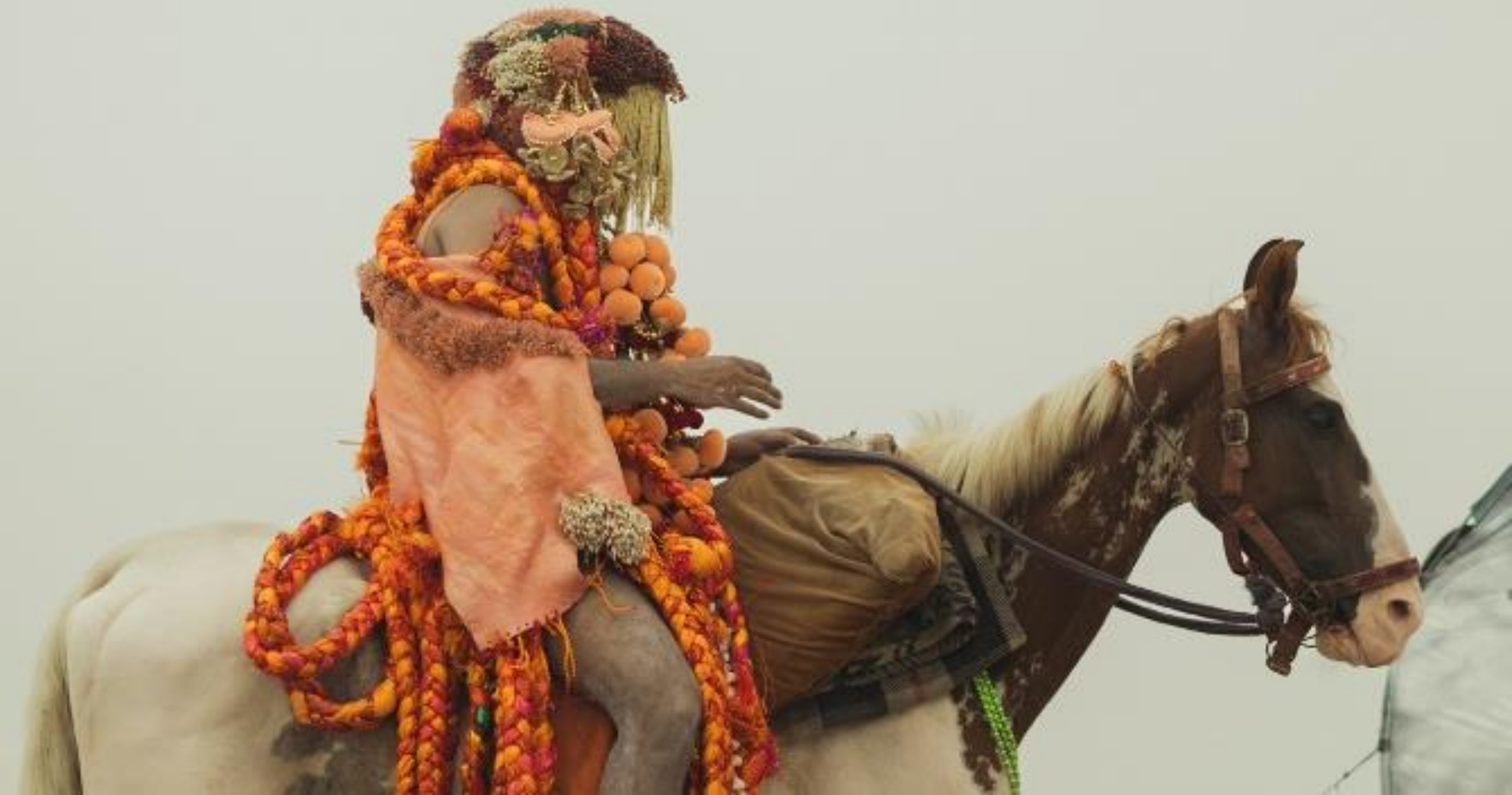
Detail of Thousand Years of Dreams Photo 1