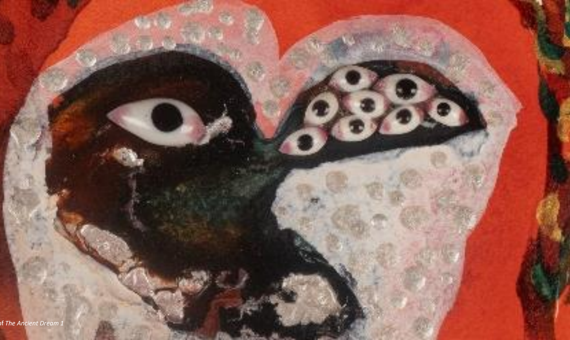
Detail of The Ancient Dream 1