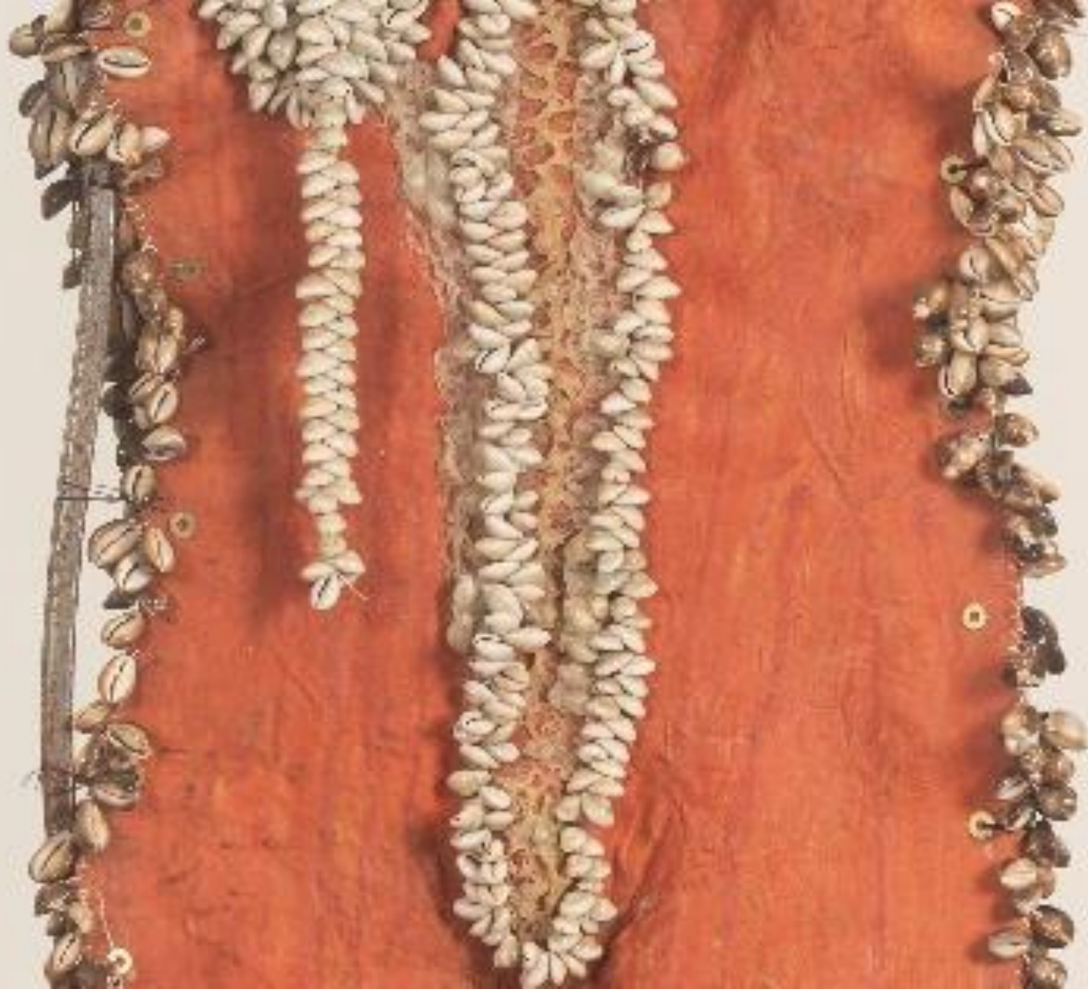
Detail of Shells of Past Life 1