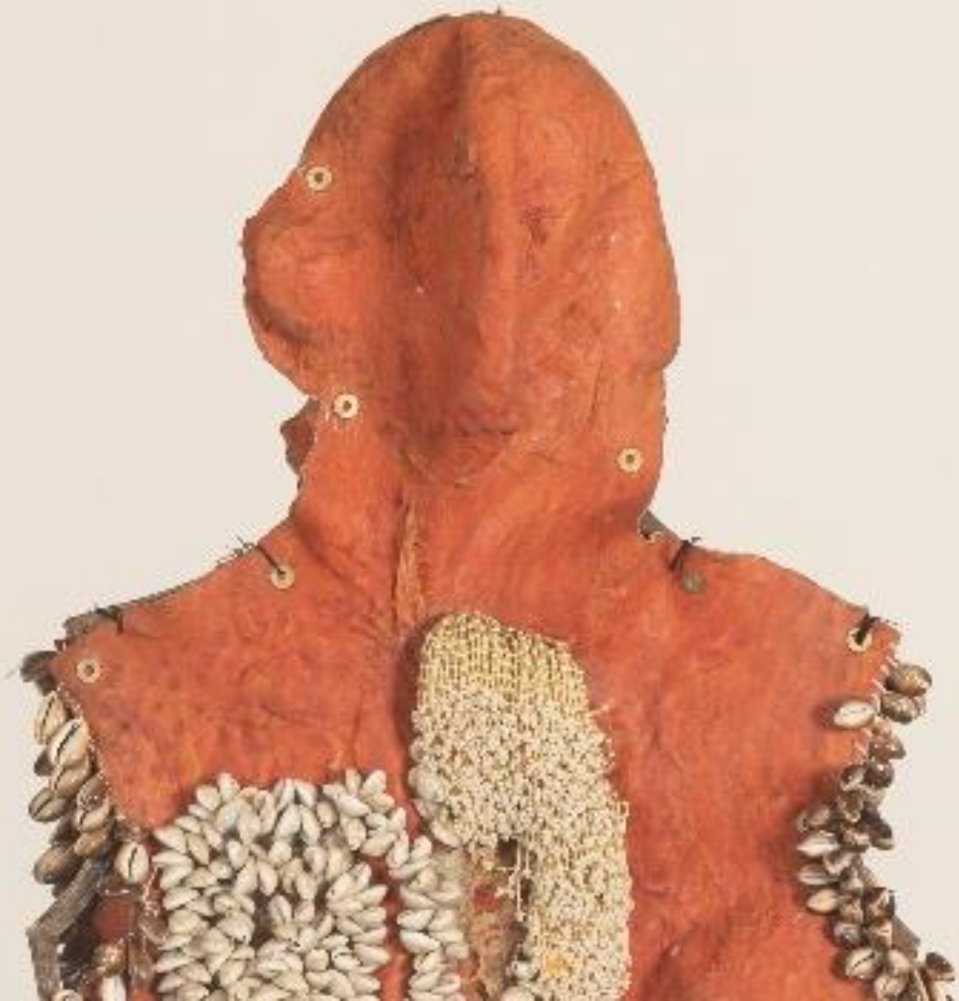
Detail of Shells of Past Life 1