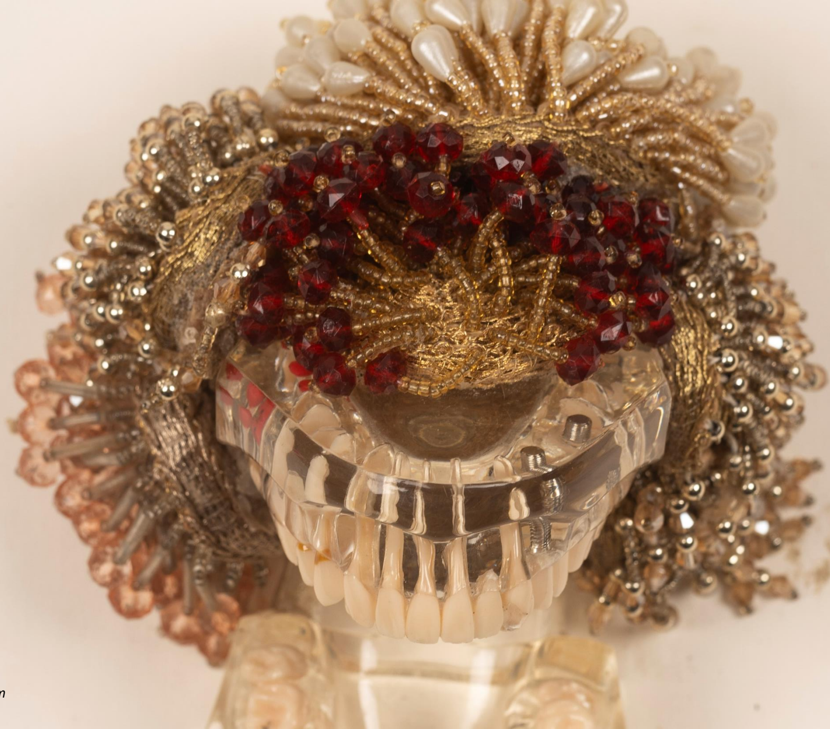
Detail of Remnants of the Dream