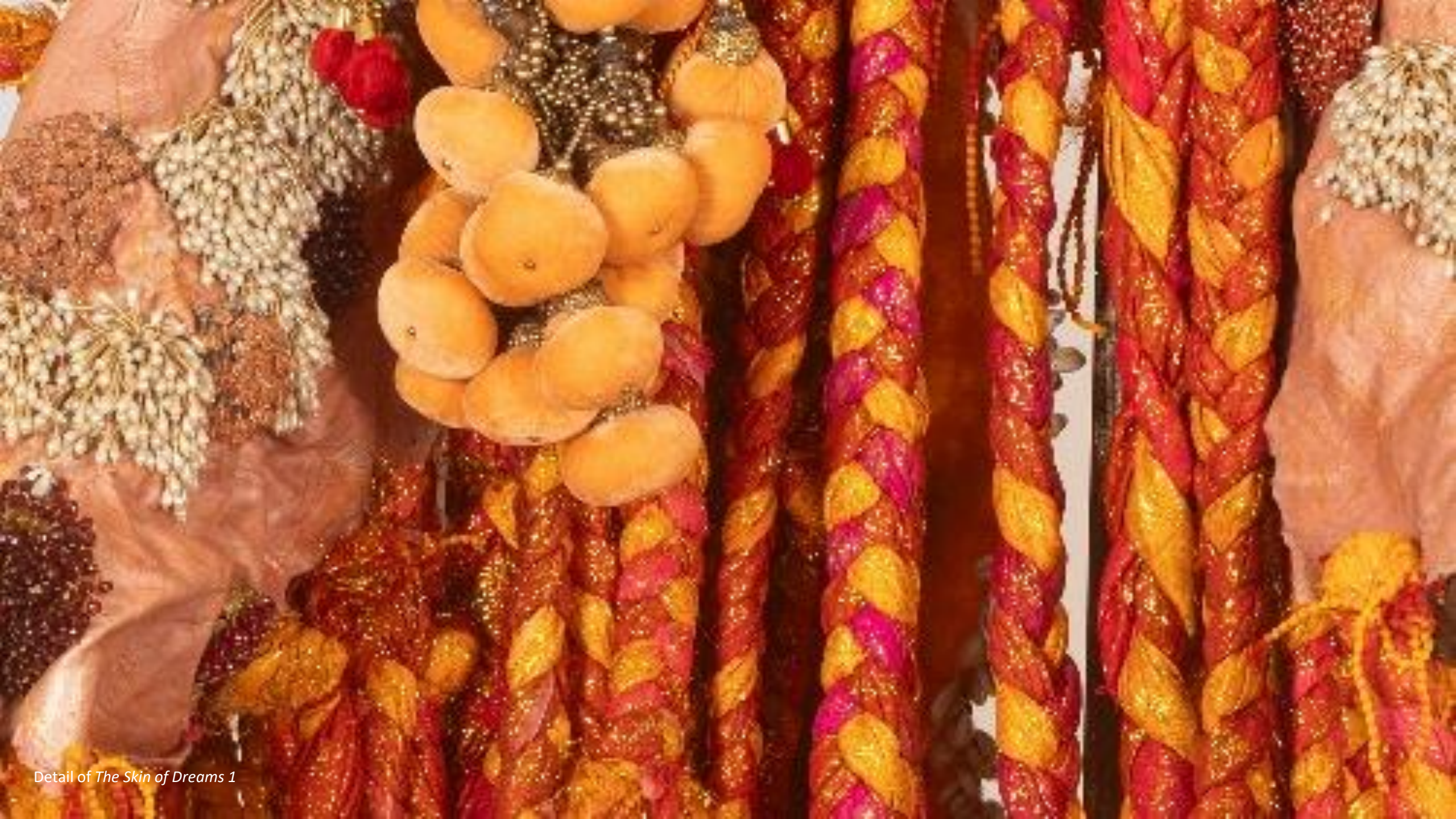
Detail of The Skin of Dreams 1