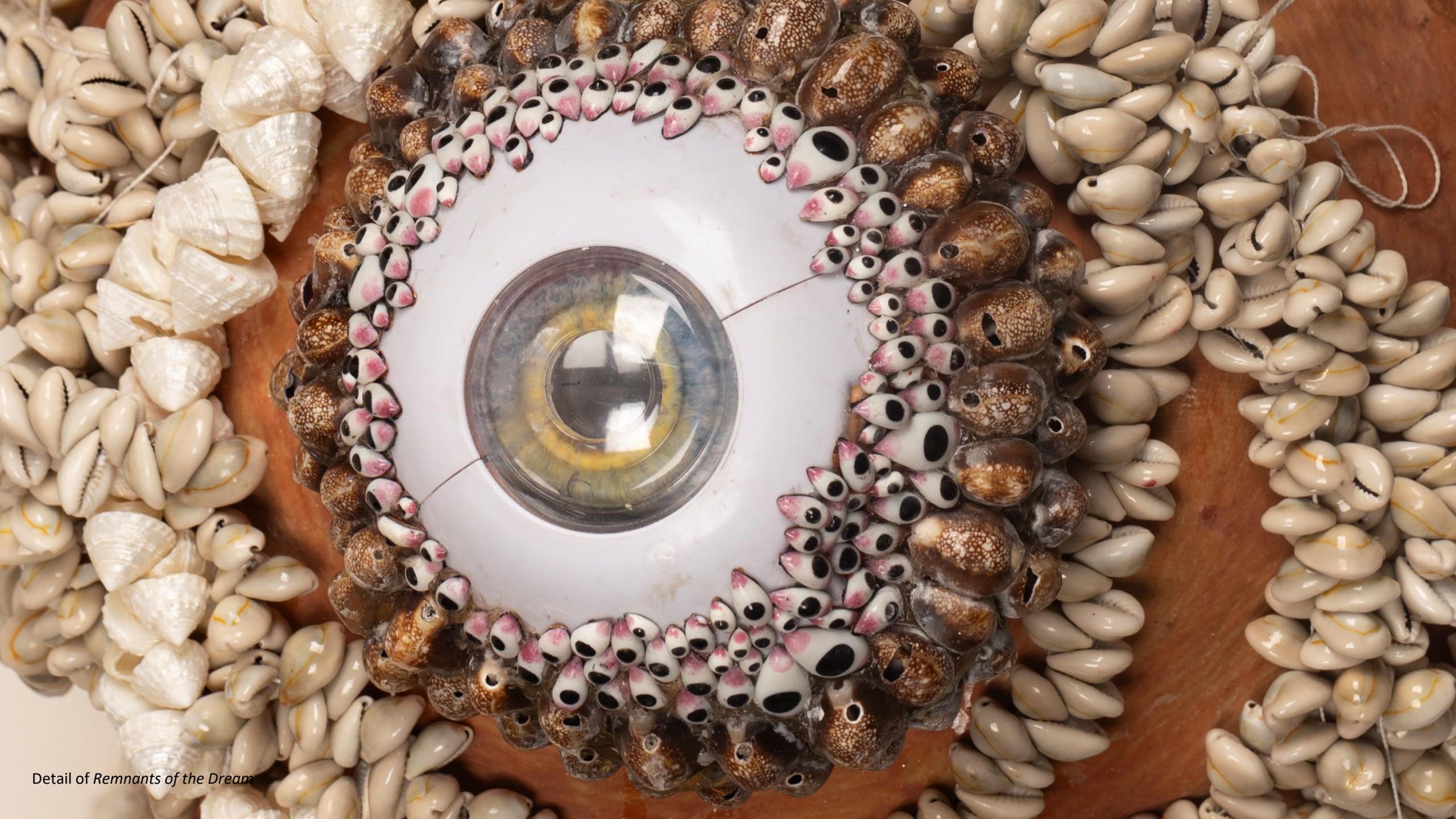
Detail of Remnants of the Dream