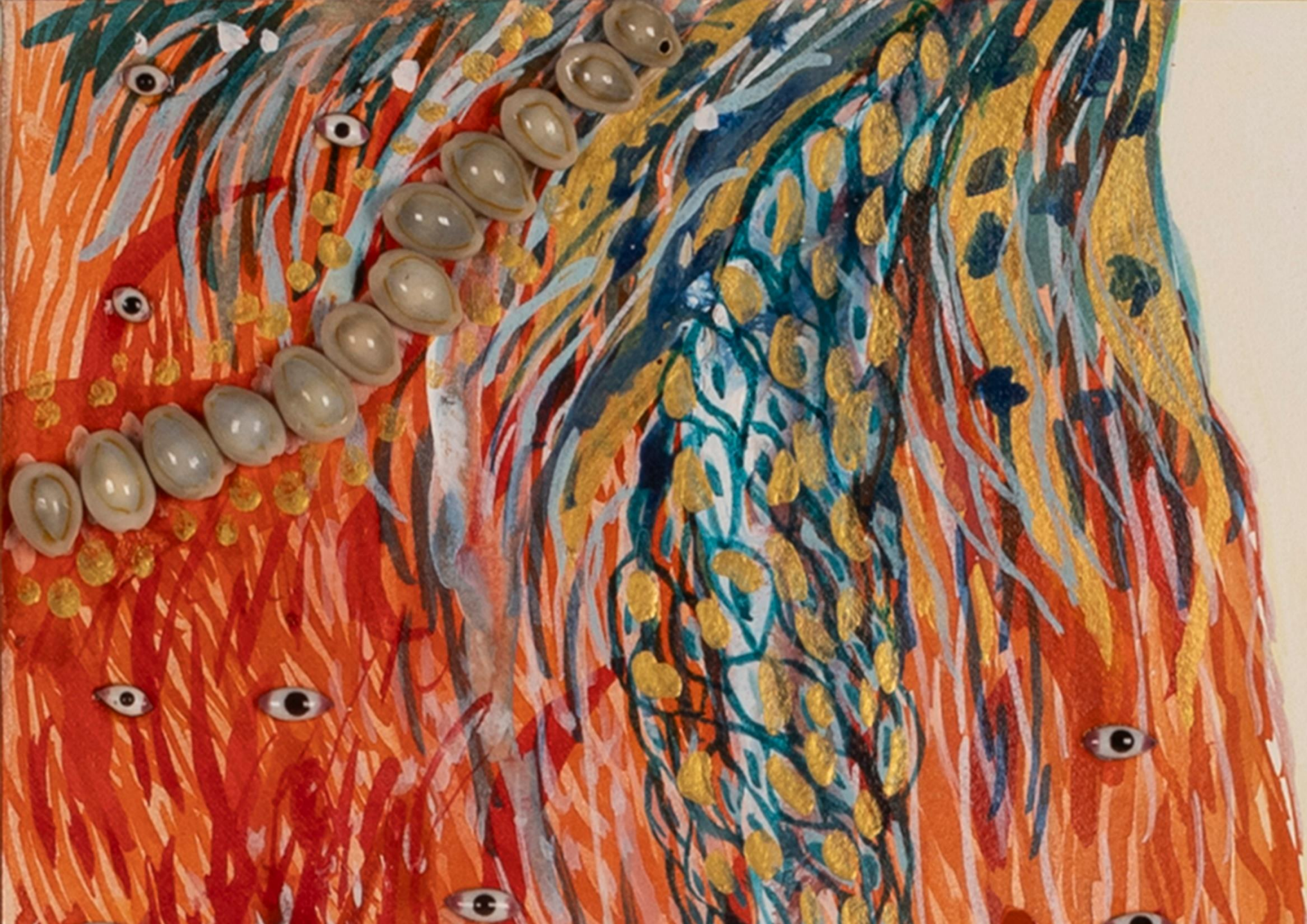
Detail of The Ancient Dream 2