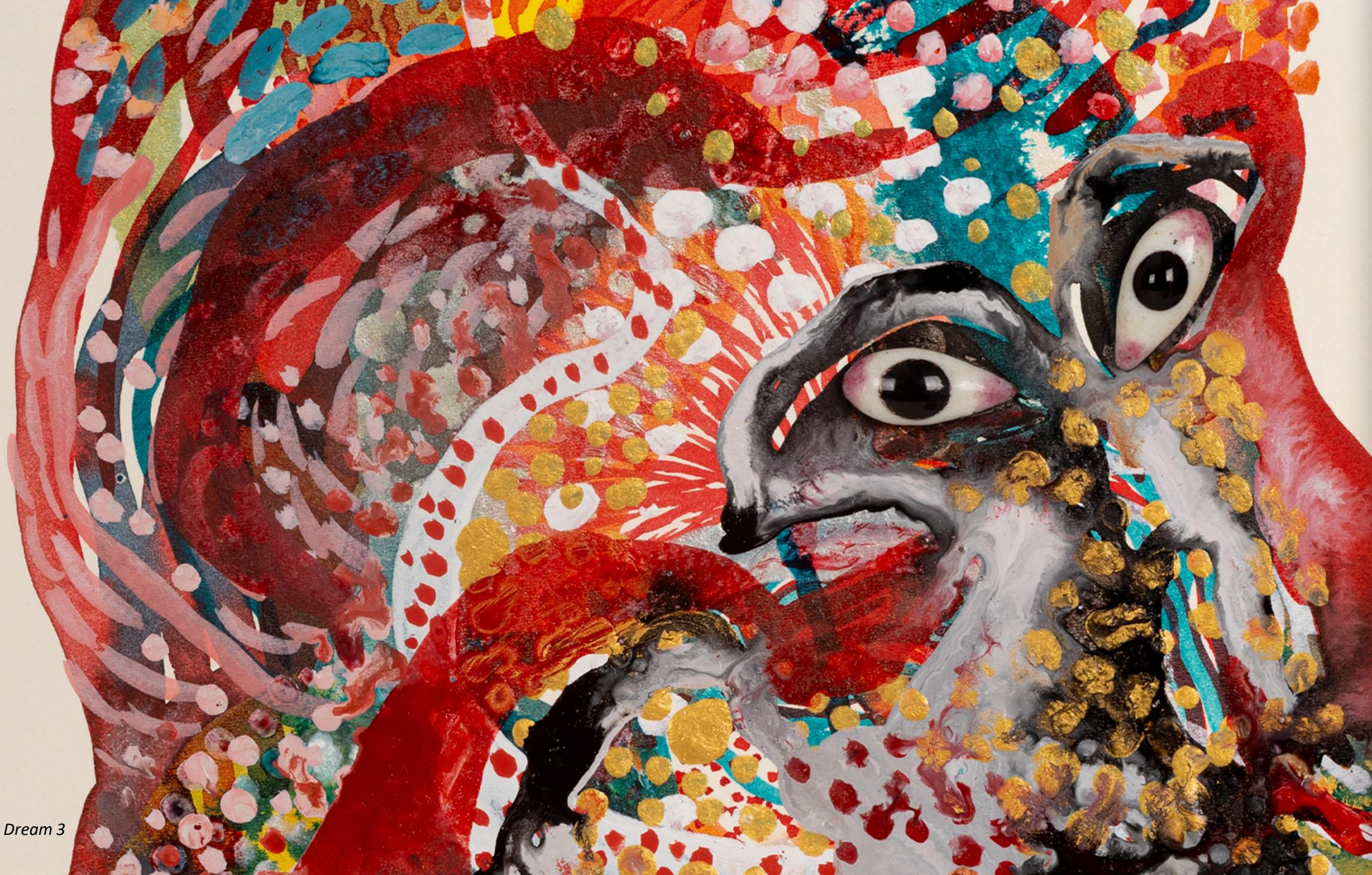
Detail of The Ancient Dream 3