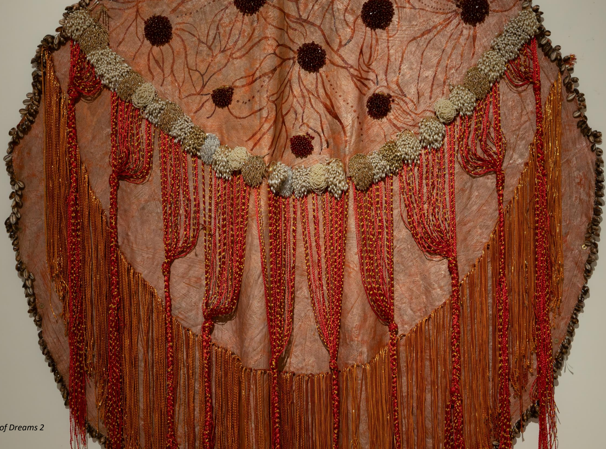
Detail of The Skin of Dreams 2