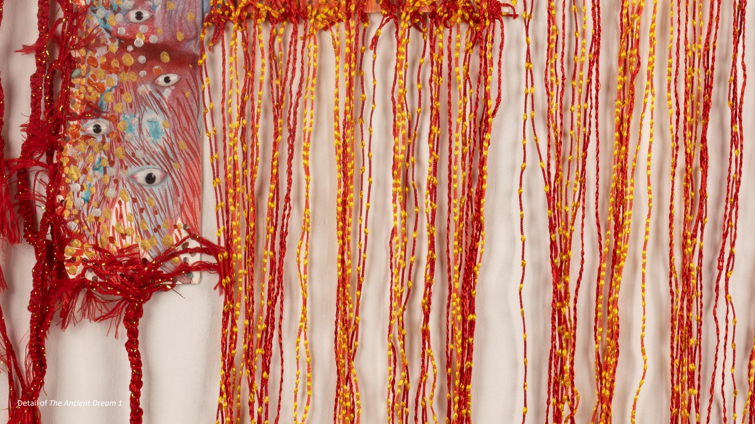
Detail of The Ancient Dream 1