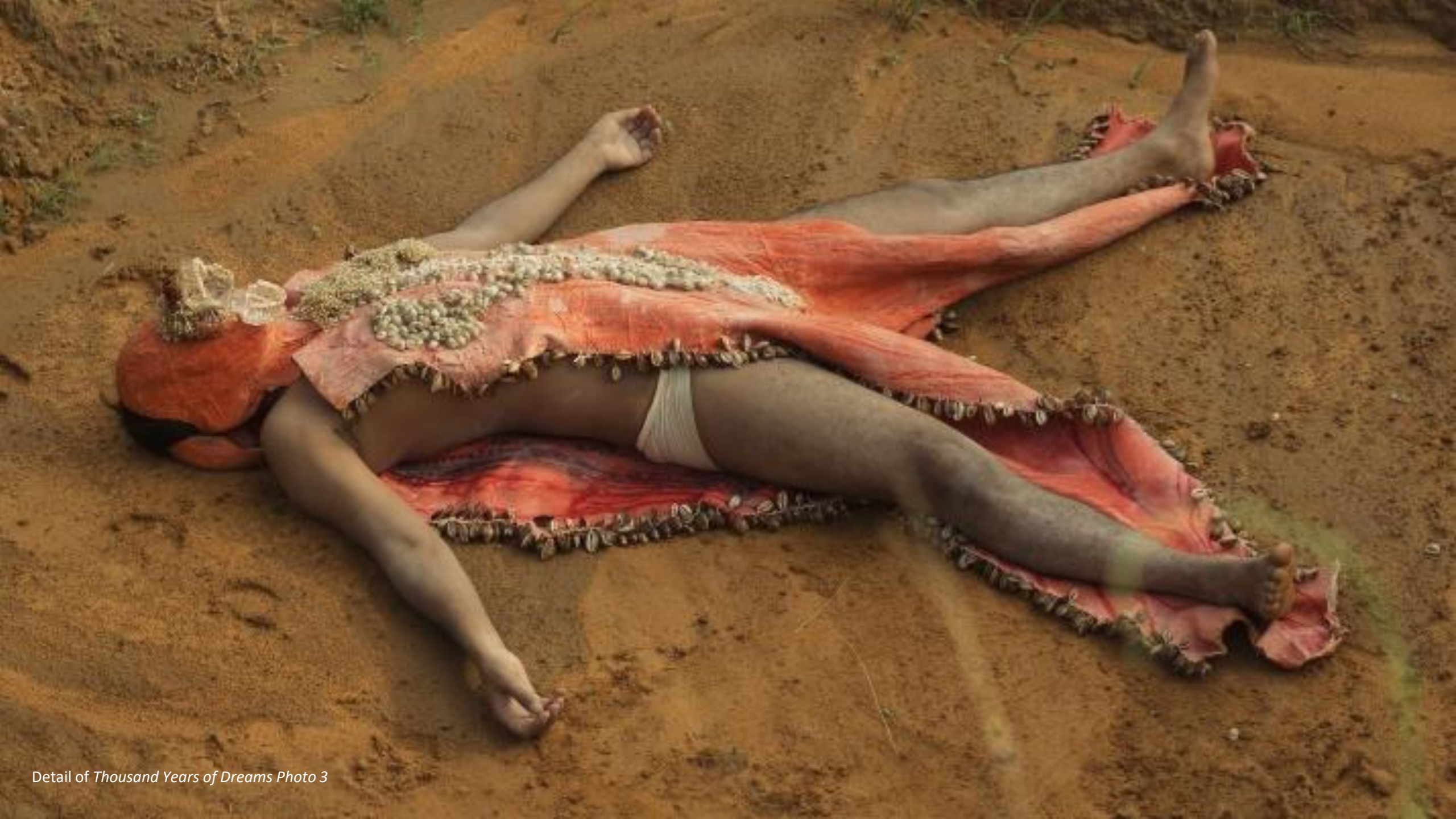
Detail of Thousand Years of Dreams Photo 3