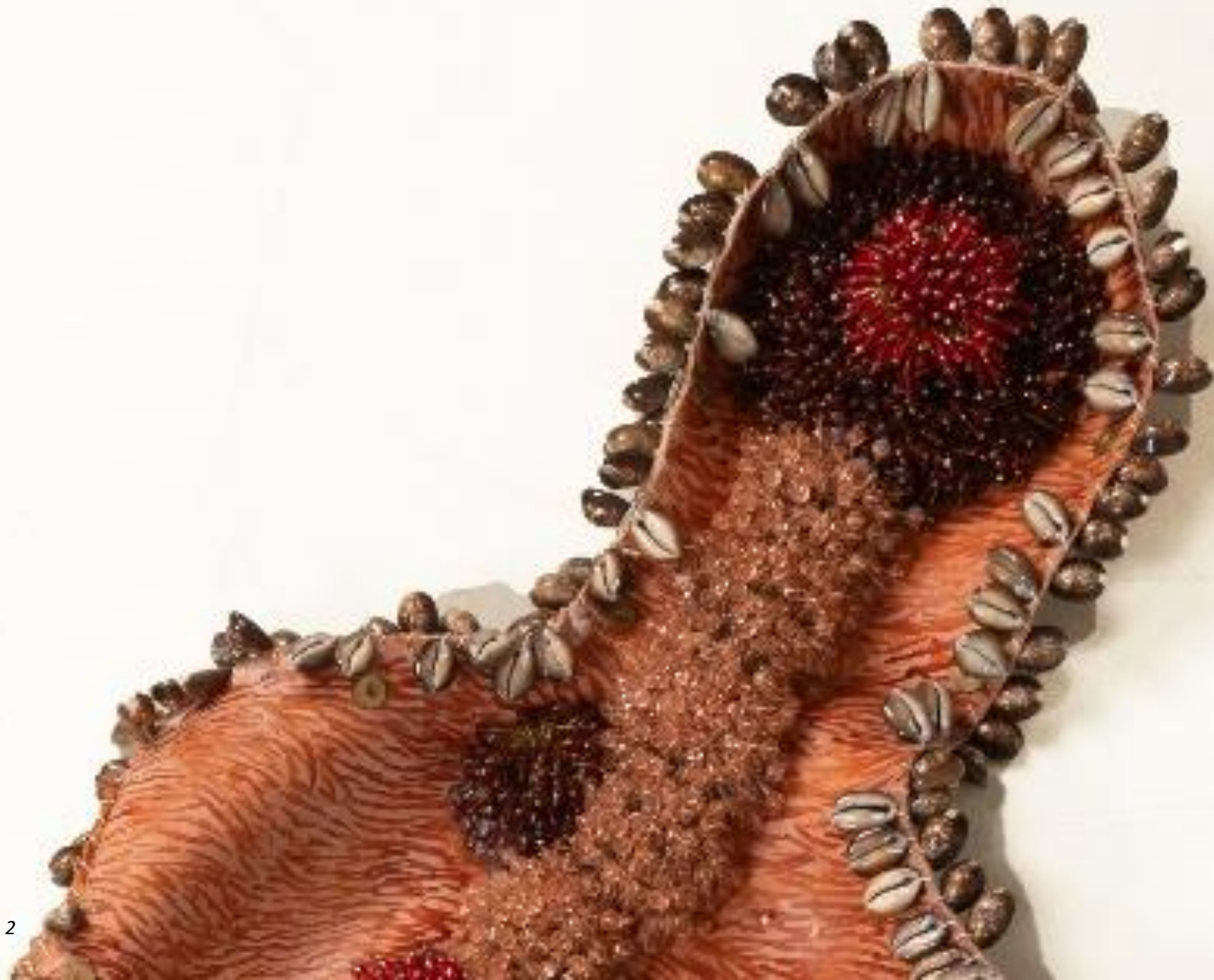
Detail of Shells of Past Life 2