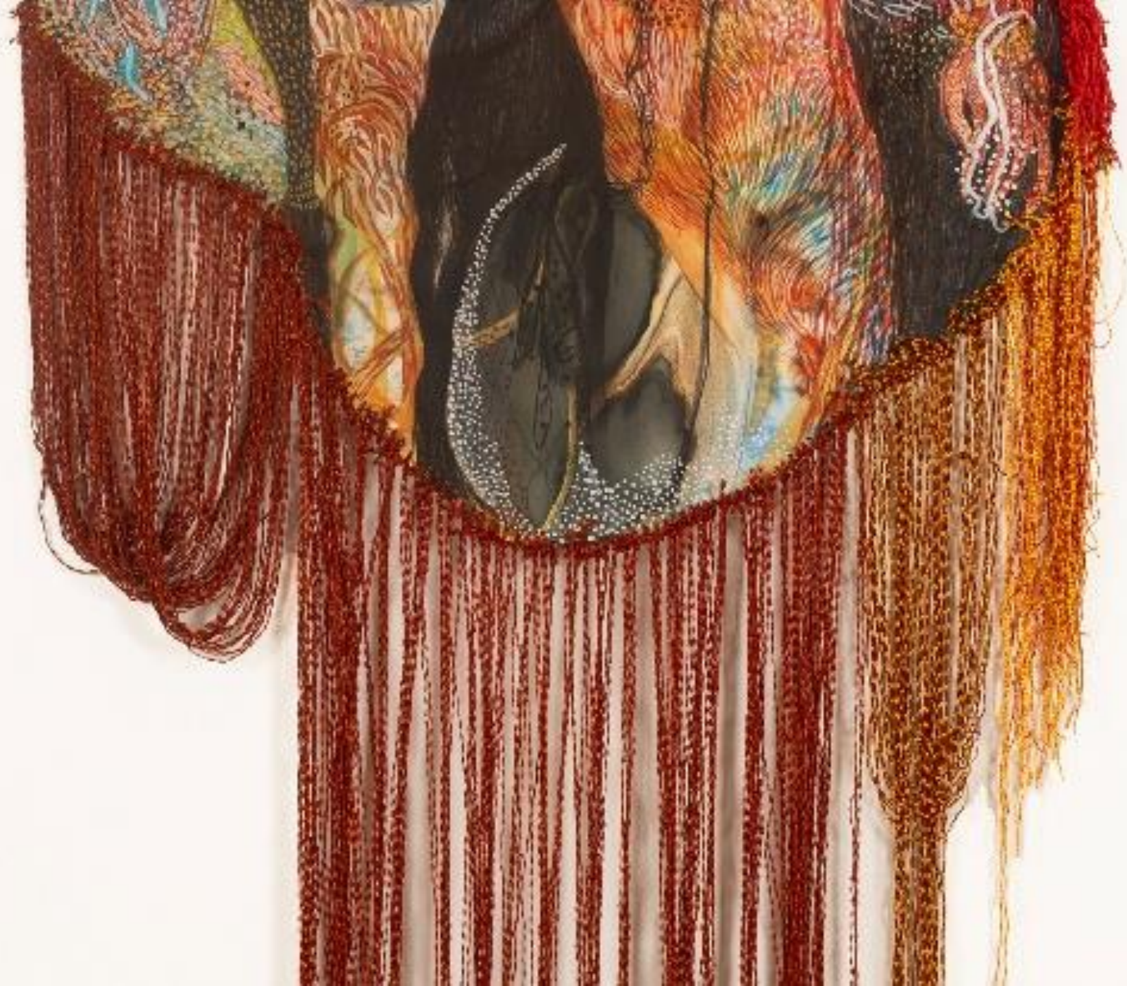
Detail of Anatomy of a Dream