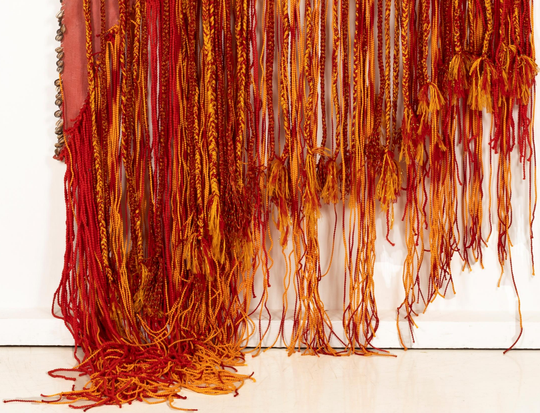
Detail of Skin of Unfolding Desires