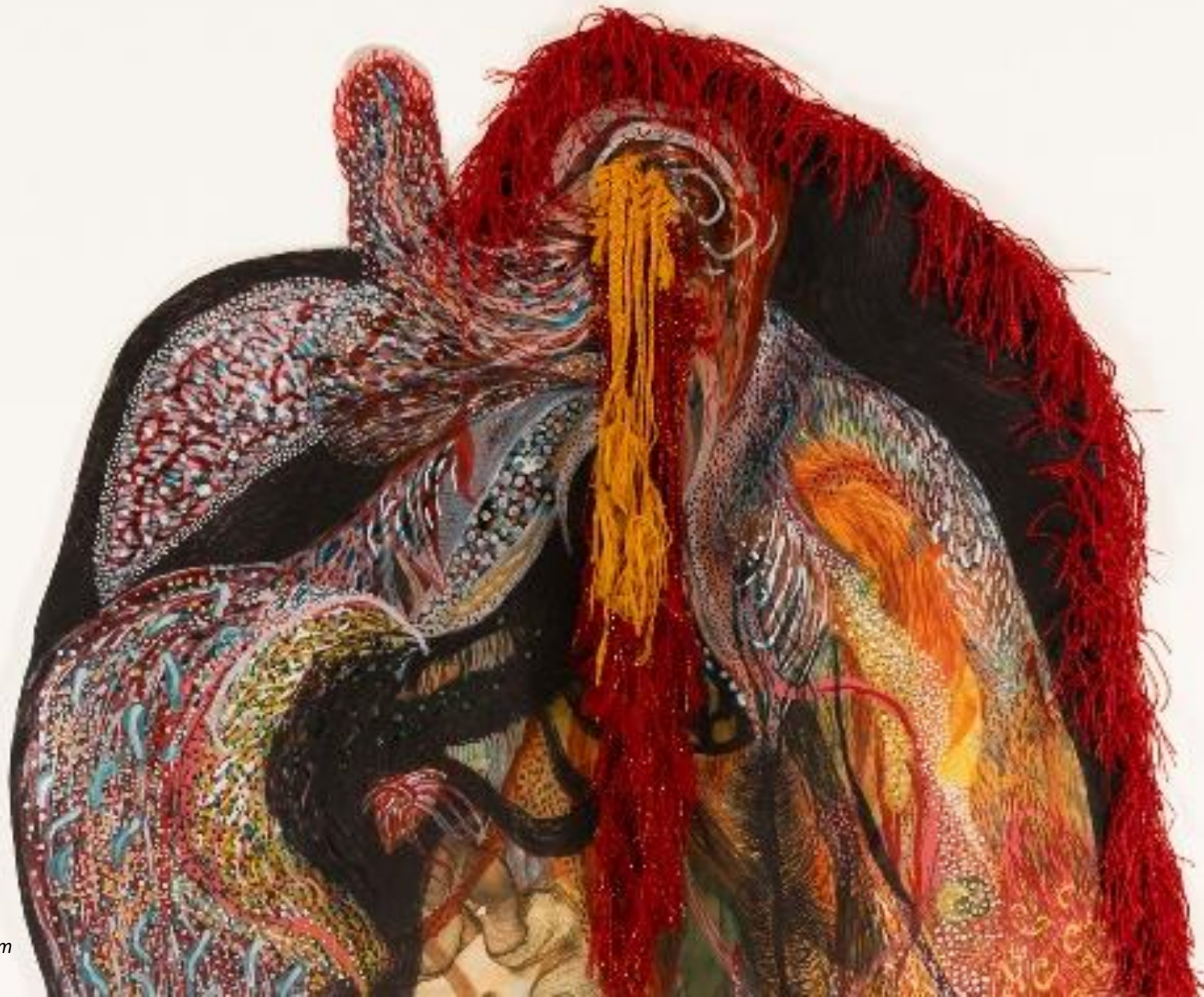
Detail of Anatomy of a Dream