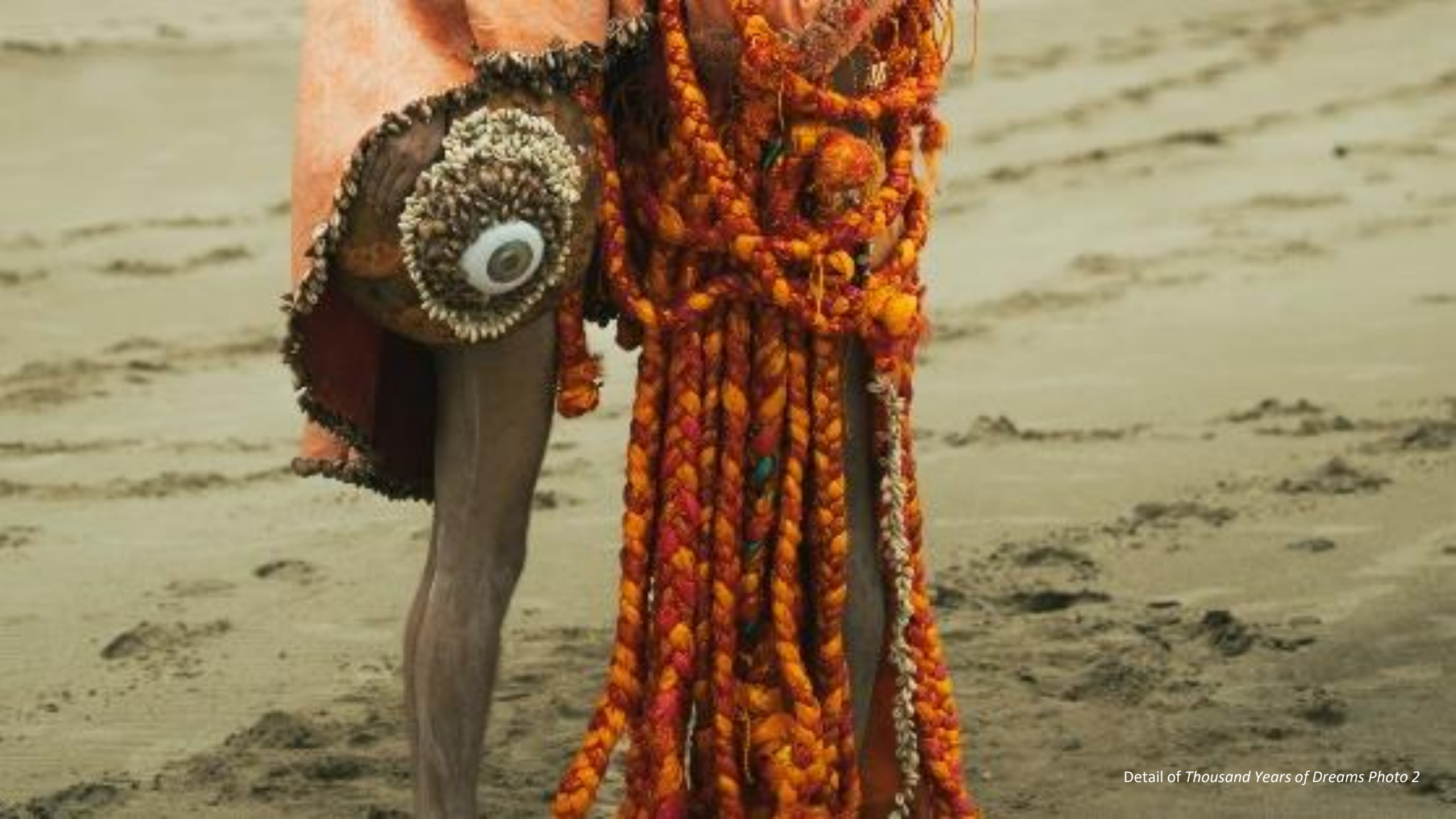
Detail of Thousand Years of Dreams Photo 2