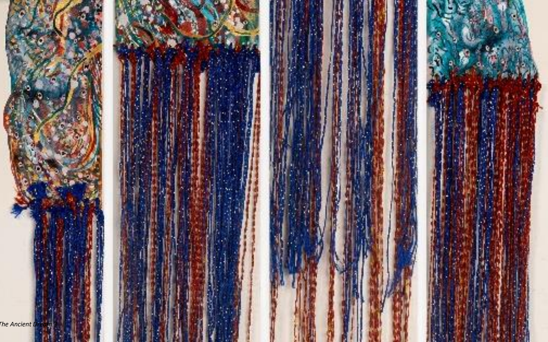
Detail of The Ancient Dream 3