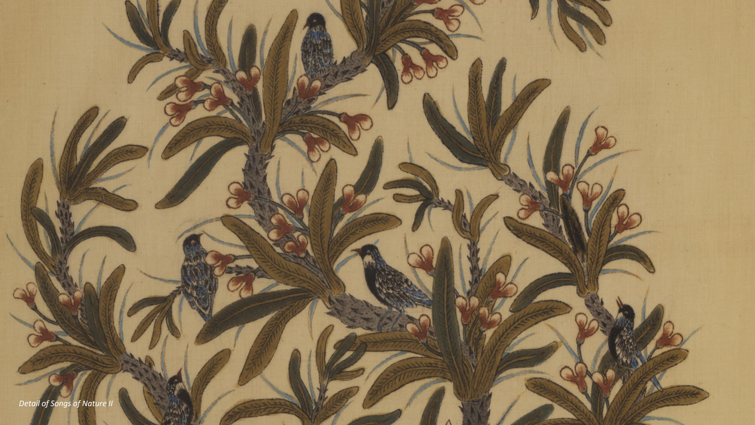
Detail of Songs of Nature II