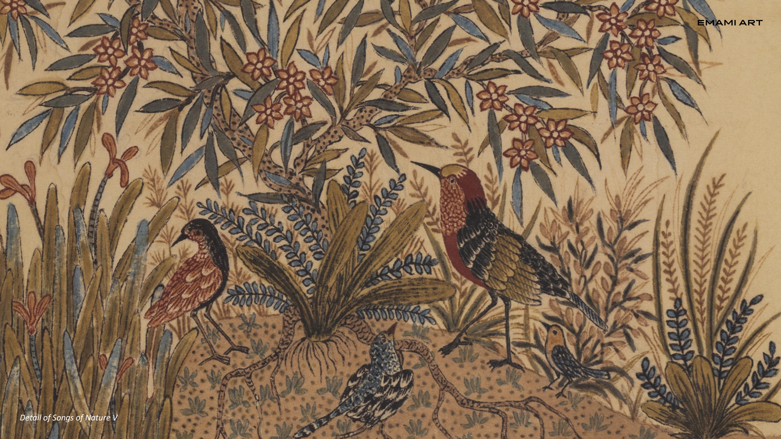
Detail of Songs of Nature V