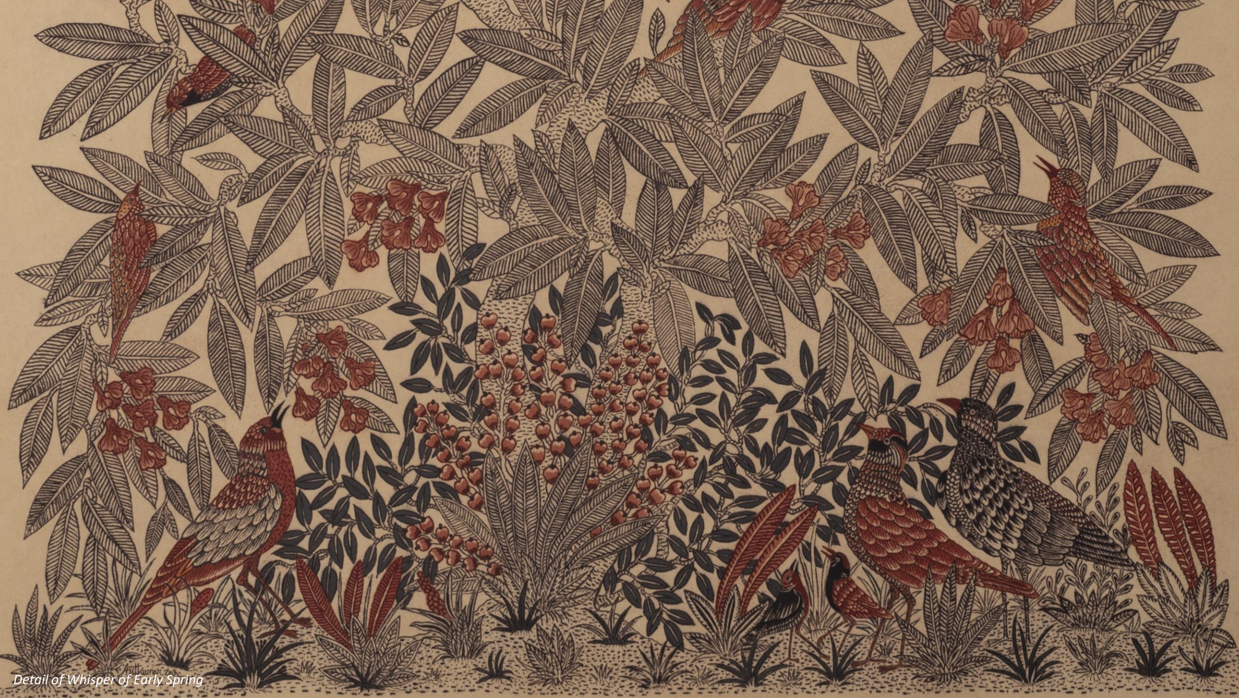
Detail of Whisper of Early Spring