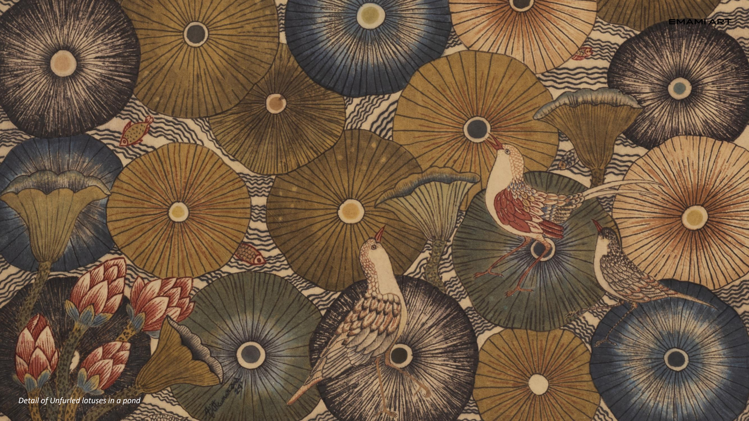
Detail of Unfurled lotuses in a pond