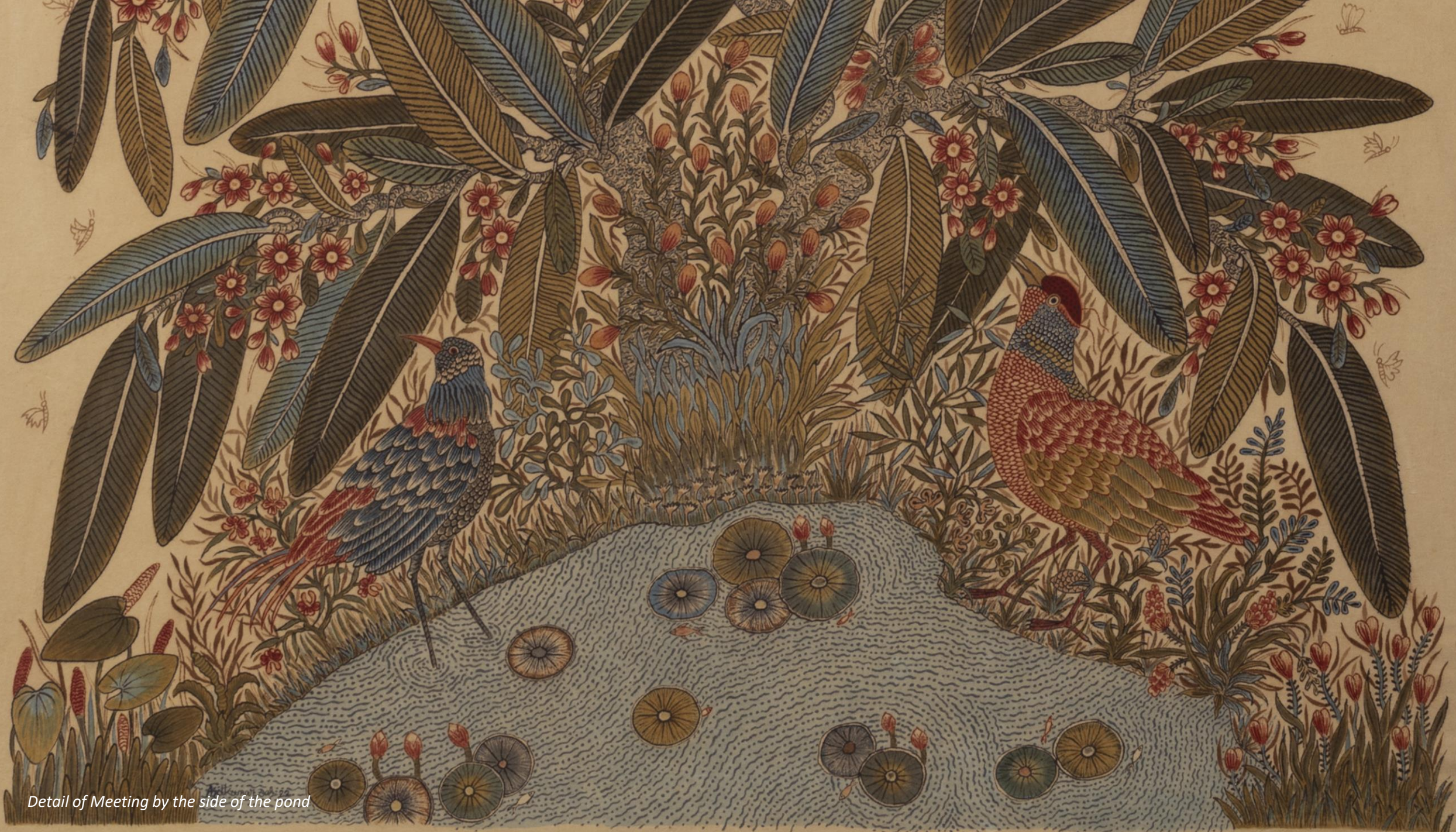
Detail of Meeting by the side of the pond