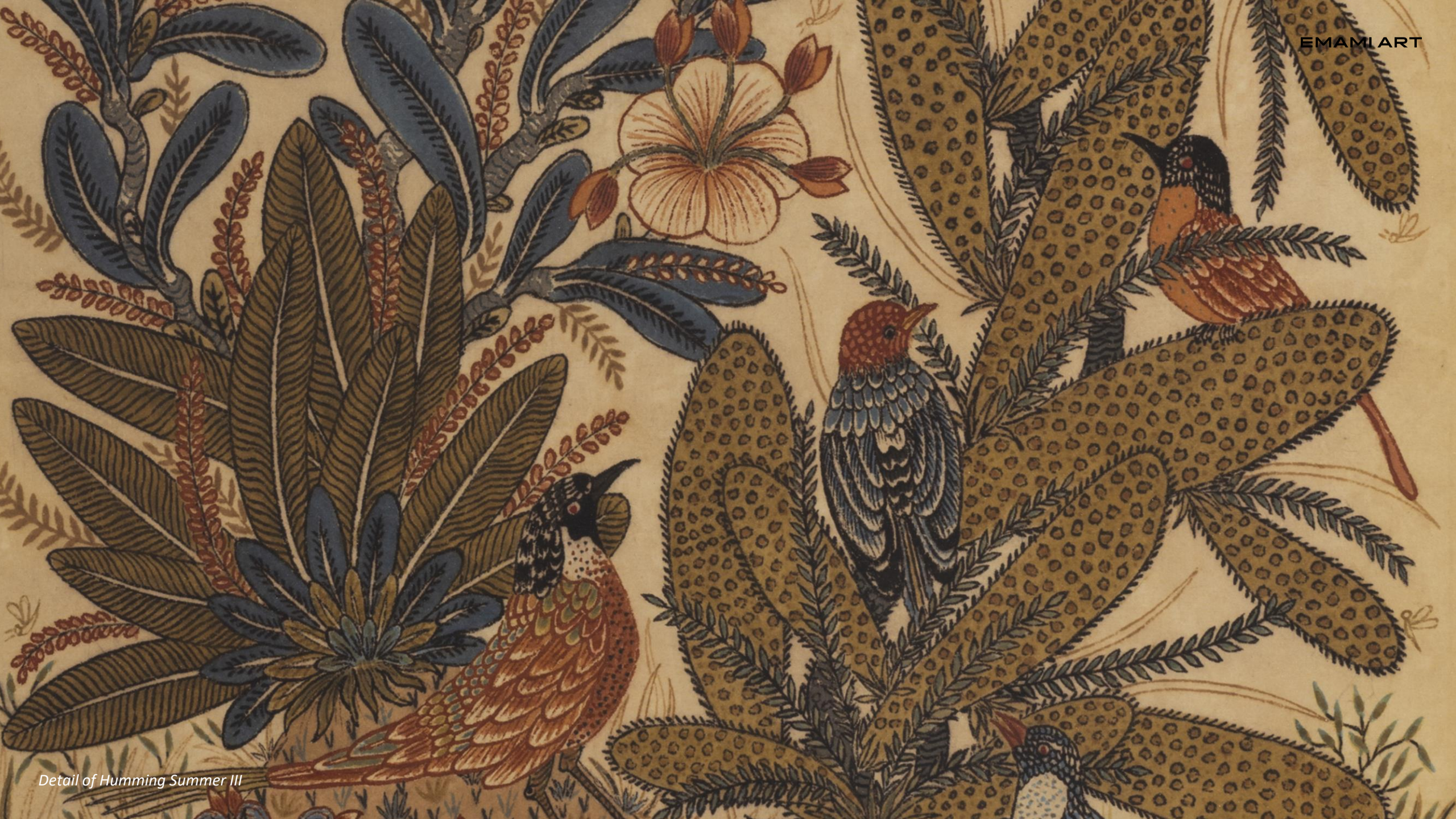
Detail of Humming Summer III