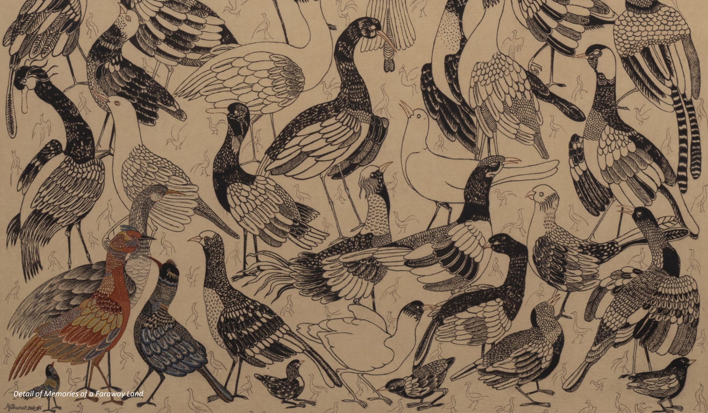
Detail of Memories of a Faraway Land