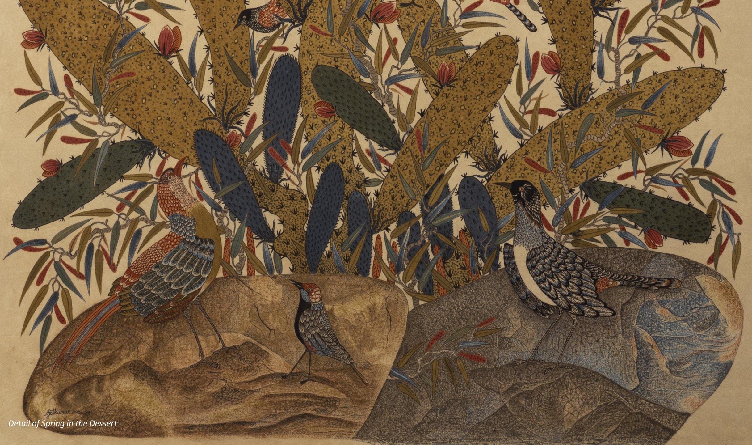
Detail of Spring in the Desert