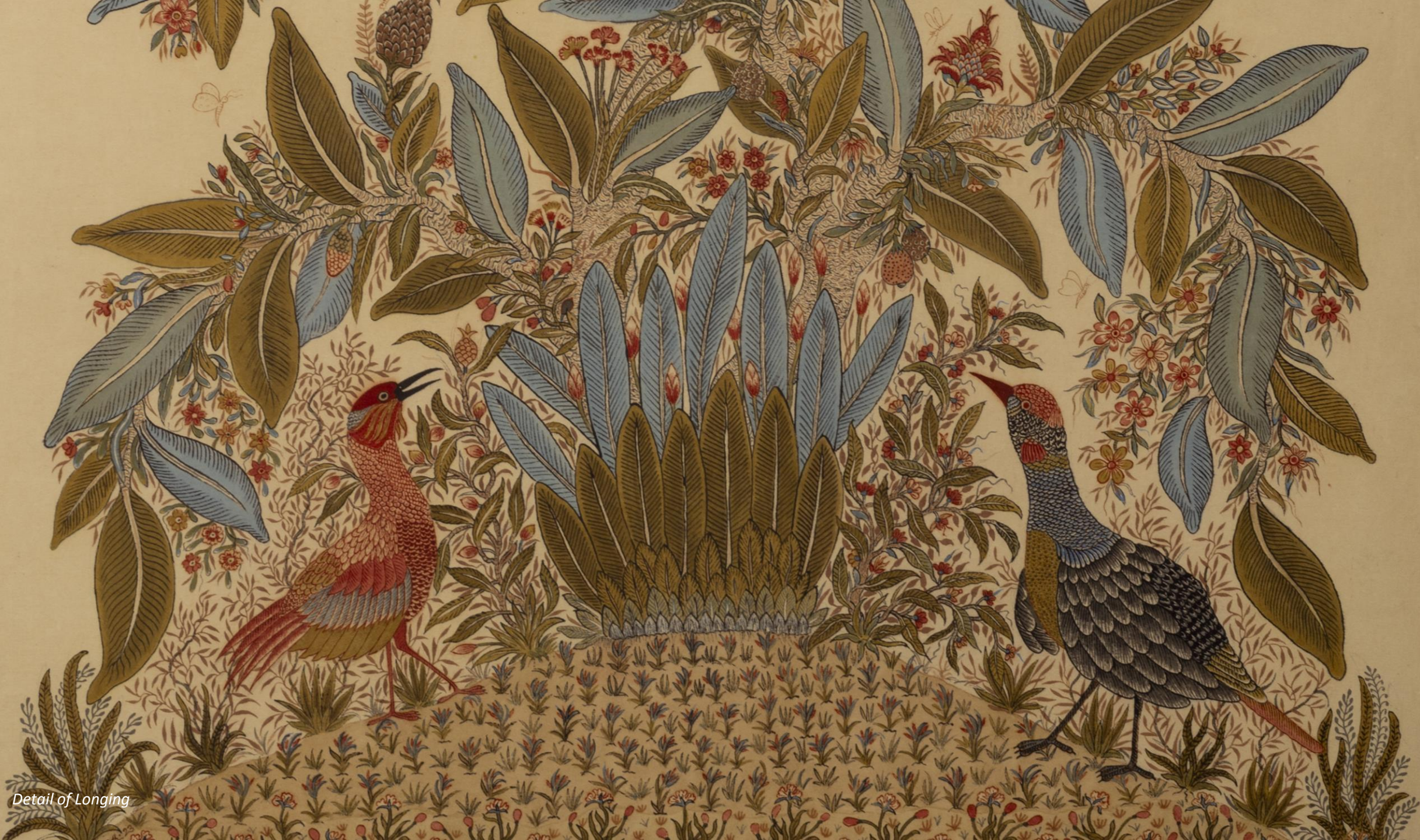
Detail of Longing