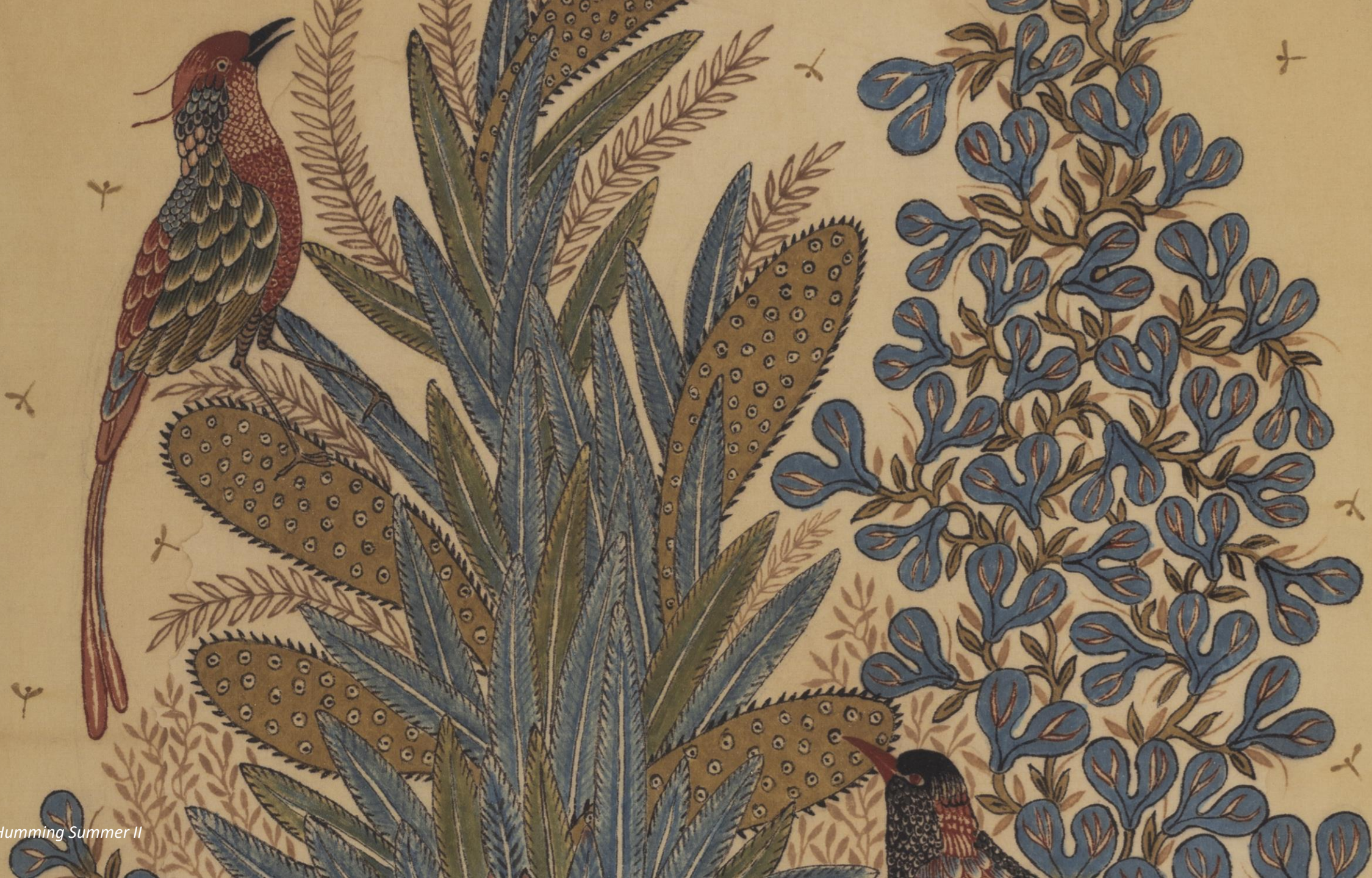
Detail of Humming Summer II