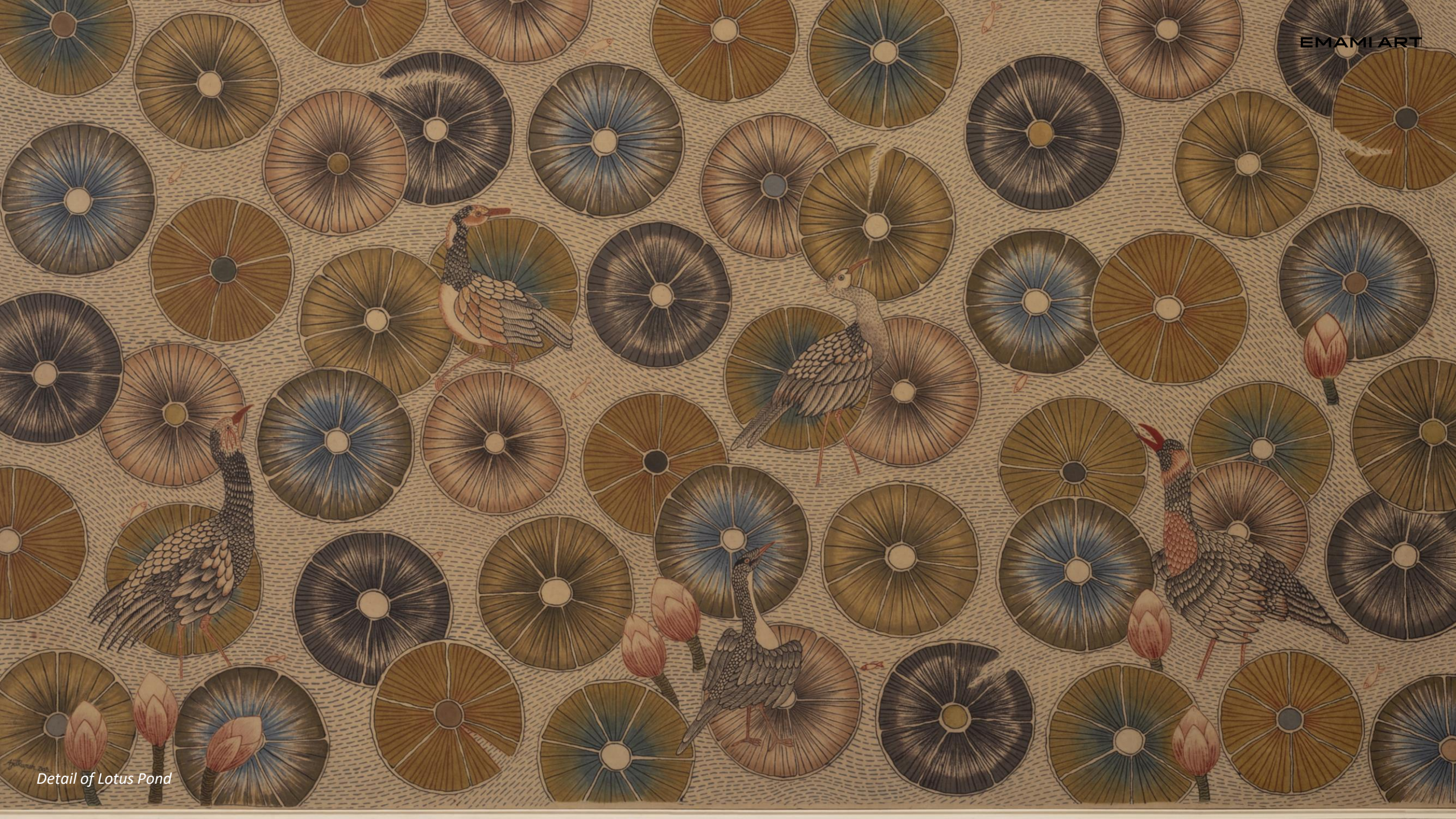
Detail of Lotus Pond