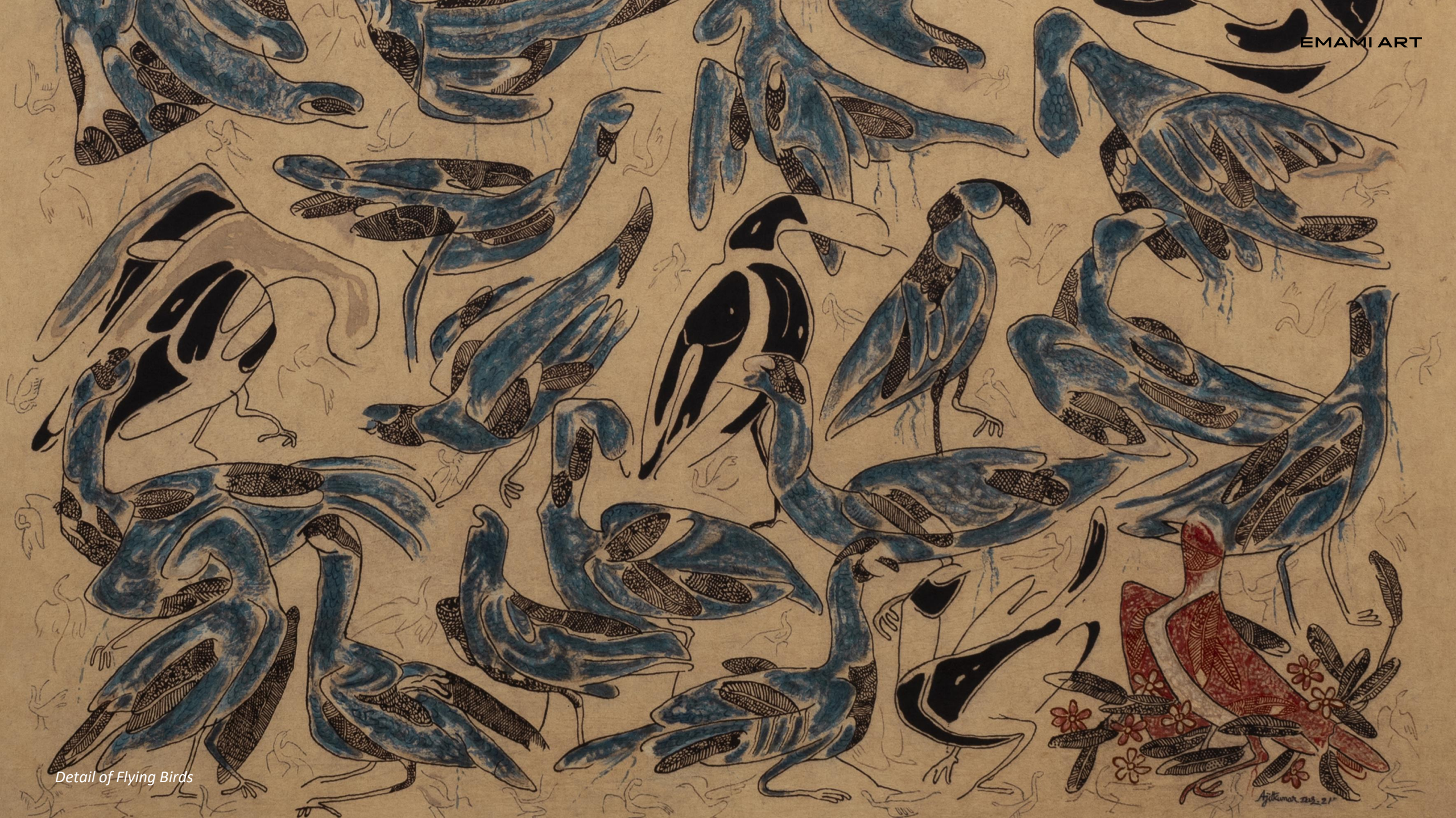
Detail of Flying Birds