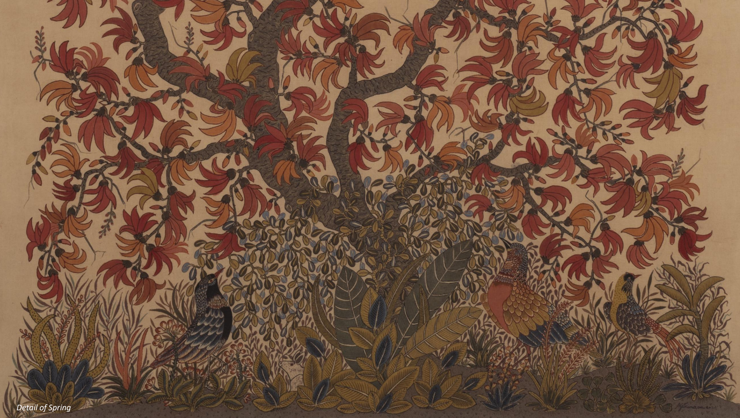
Detail of Spring