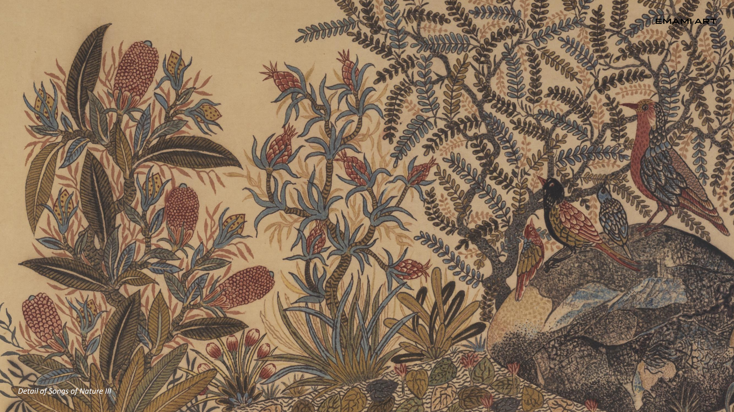
Detail of Songs of Nature III