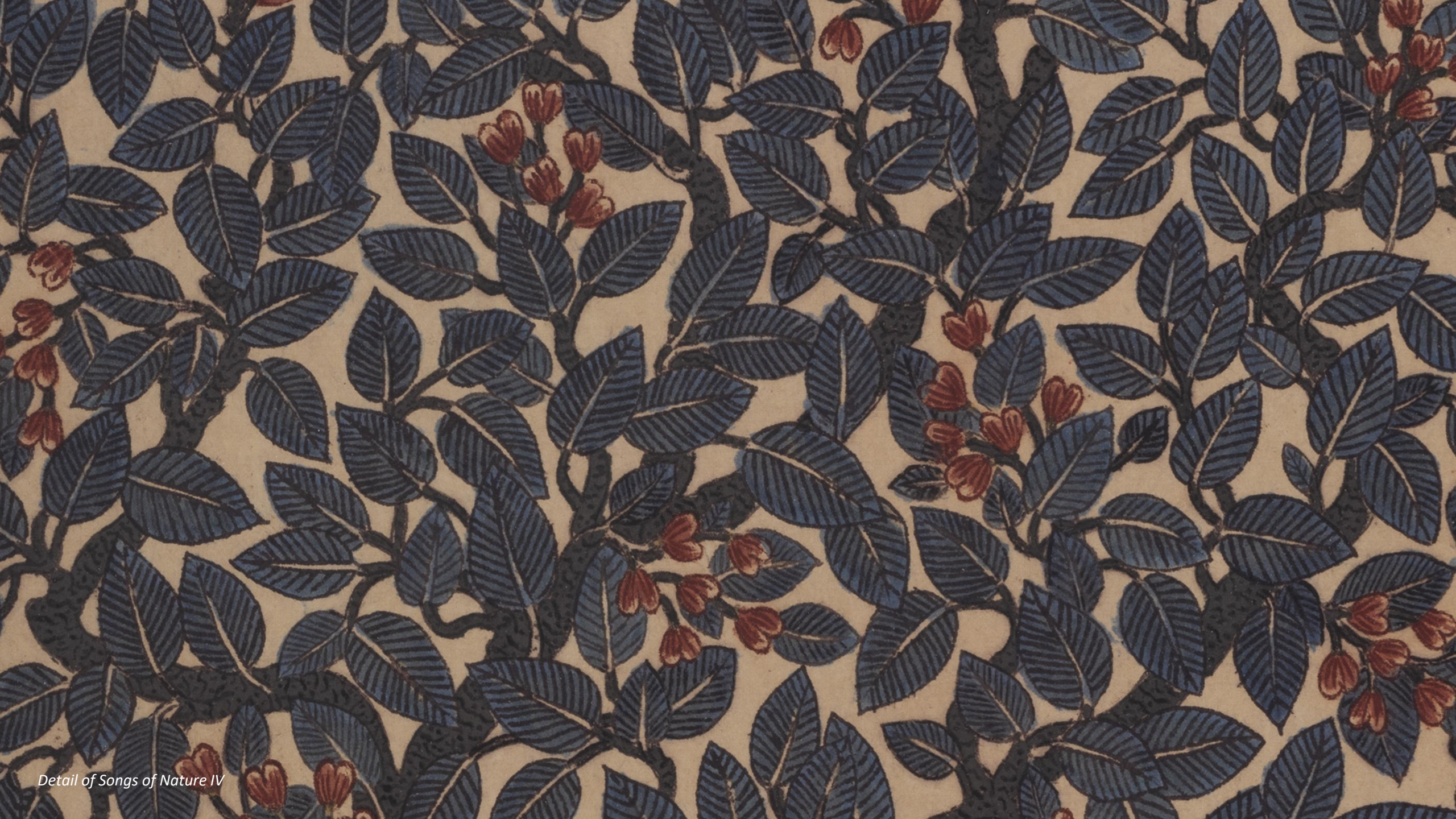
Detail of Songs of Nature IV