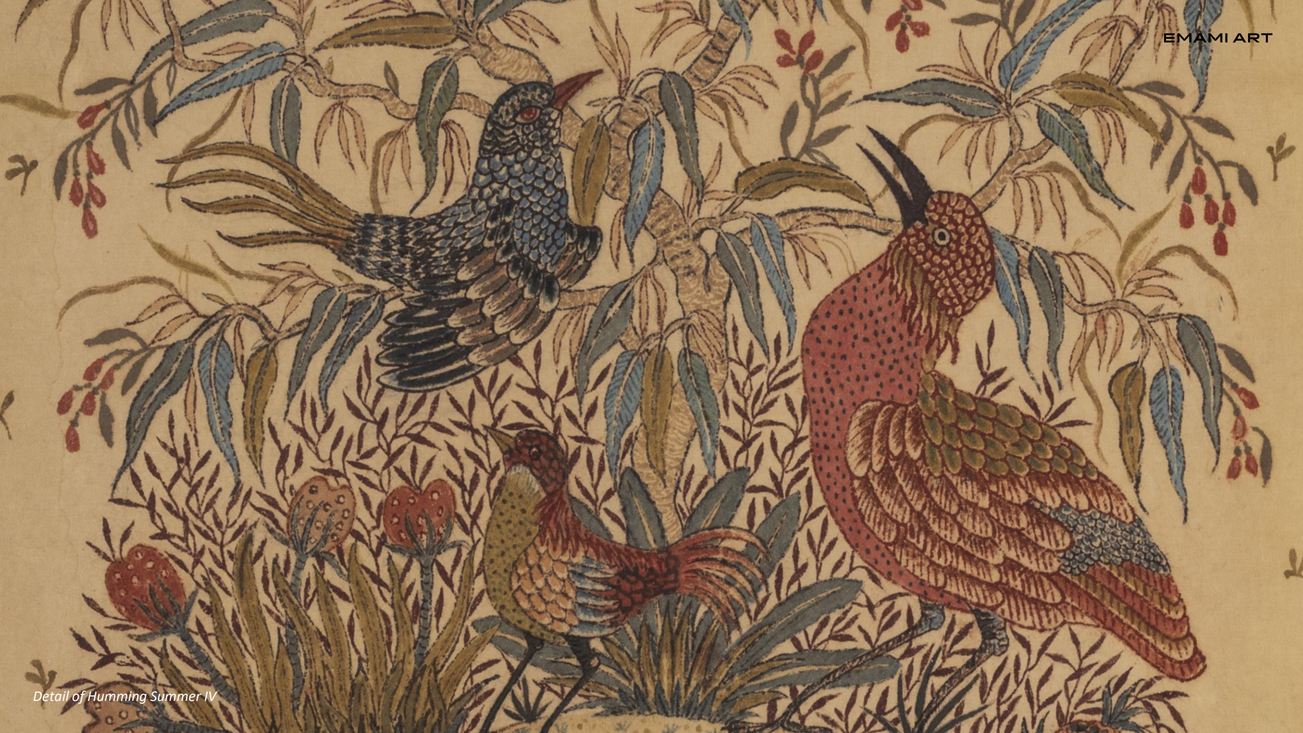
Detail of Humming Summer IV