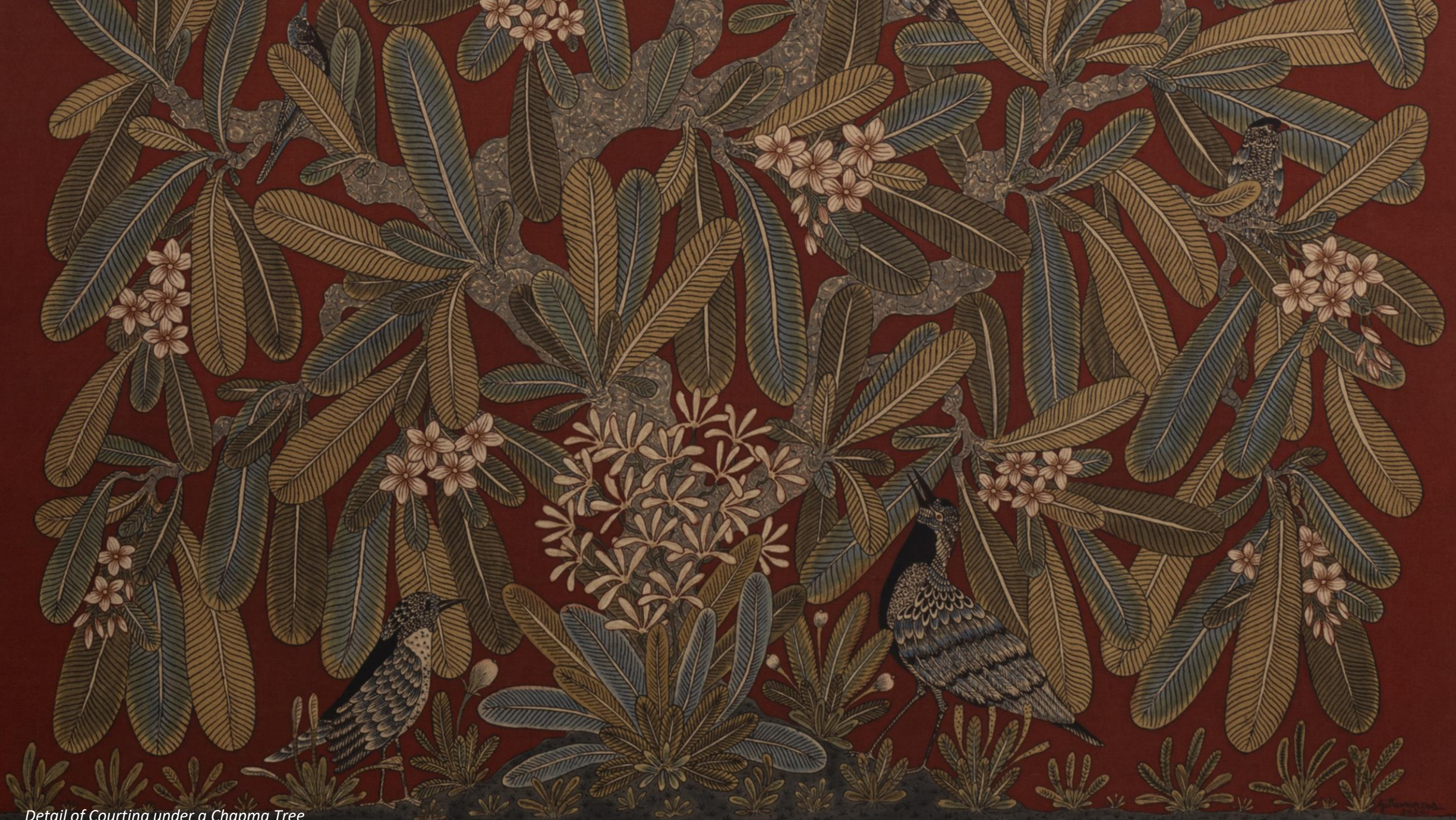
Detail of Courting under a Chapma Tree